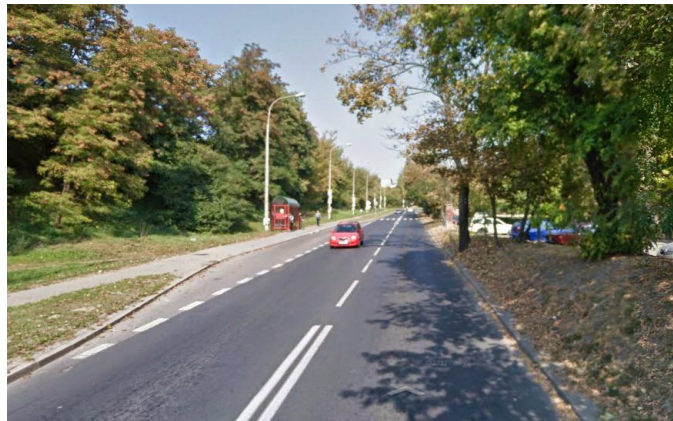
Heavy ascent on Kosmowska

At an altitude of 6 km (roundabout Krwiodawcow) begins one of the most enjoyable episodes of the marathon - about kilometer downhill run up to 5%. It is at this stage to get some rest because after a while, turn North Street, and then in the street. Irena Kosmowska. Begins about 700 meters ascent (2.5% -5%)