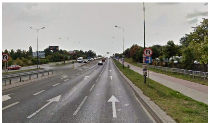
Short but steep ascent to the Spoldzielczosci Pracy

Next four kilometers a flat course through the streets of Czechow. The fact that we run in Lublin recall around the 12th kilometer. First, we have to overcome the short ascent on the street. Dysa, and after a while we come across the street Spoldzielczosci Pracy where after about 300 meters down starts very strong 400 meter ascent (3% -4%).