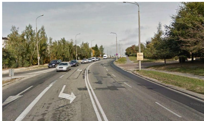
Diamentowa – ascent

Reaching their 28 km turn onto Diamentowa. We run a mile down slightly after a while to beat about 250 meter ascent (2% -3%).