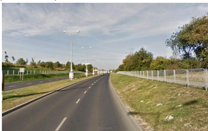
The second ascent on John Paul II

After a slight expropriation, and even a momentary run down at the height of the intersection of the street. Army Street continuing struggle with Pope John Paul II. Another 2 km are further ascent with a slope of approximately (1.5% -2.5%).