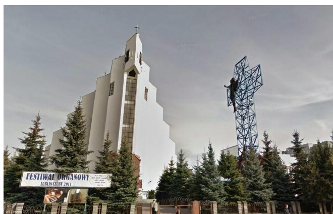
Holy Family Parish (Parafia Swietej Rodziny) - the end of the first ascent

We are at 31 km. It begins with the heaviest piece of Marathon Lublin. Nearby ascent is 1.5 km (1% -2.5%) to the Church of St. Holy Family. It was here that John Paul II during his visit in 1987, dedicated to the only bell built church.