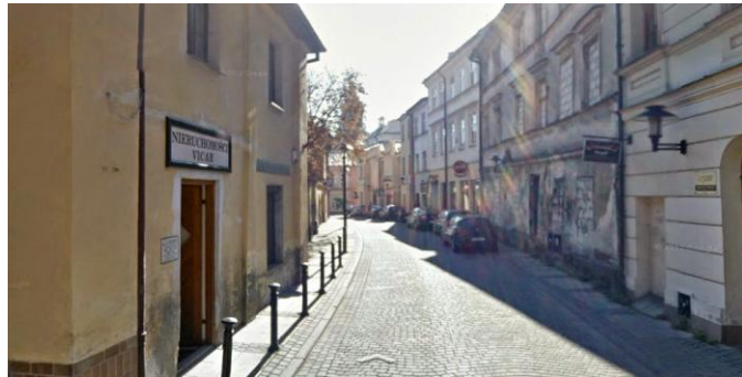
Green (Zielona) Street - a narrow, presses, but nicely

After take-off and go around the Lithuanian Square Green get onto the street. Narrow street surrounded by historic houses leads us to Royal Street.