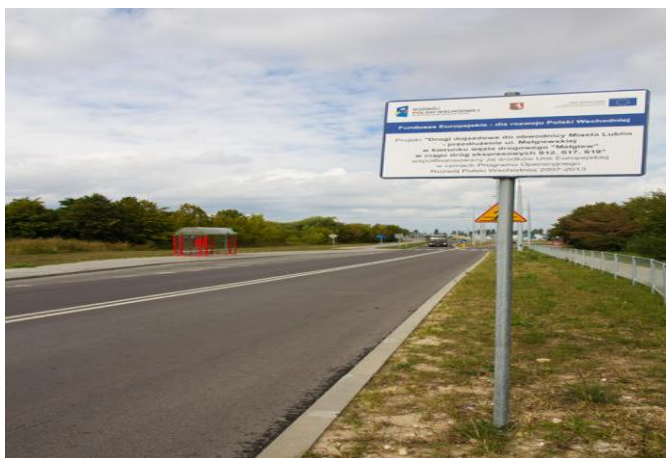
Street Grygowa (Grygowej)

Now we turn to the right and kilometer number 19. Street Grygowa - most bad part of the route marathon. On the right in the distance we hear the barking of dogs from a nearby shelter, a bit further burial old railway warehouses (plus distinctive stench from the railway - who played as a child on railway embankments know what I mean), and a few little interesting industrial buildings.