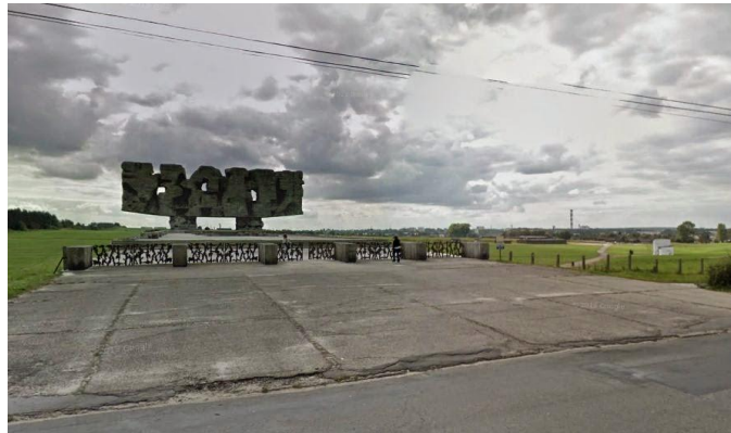
Majdanek concentration camp

At the 21 kilometer ascent we have a small (1.5%), while earlier passing Majdanek - German concentration camp established in 1941-44, which was converted into a museum. Died here about 78 thousand people, the majority of which were Jews.