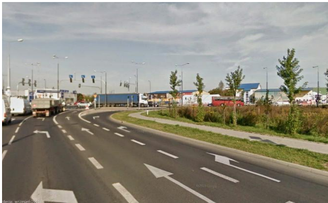
John Paul II's end, the beginning Krasnicka

Runs in the alley Krasnicka. In a moment, the 36th kilometer. From this point on will no longer be flat or downhill (not counting a few small hills of). Whoever manages to get here rather finish the marathon.