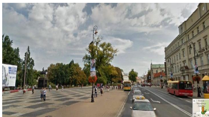
Lithuanian Square on the left, to the right of the Main Post Office

Lithuanian Square was built in the 20s of the nineteenth century (earlier in his place was the straw). Due to its initial purpose was named Drill Square. It is here, in the palace After radziwillowskiego 07.11.1918 on the first meeting of the liberated Polish government.