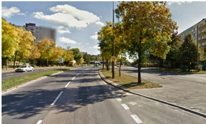
Anders (Andersa) - slight elevation

When you reach the hill for a long time, we have downhill (street Cooperative Work), and then mainly flat with a few minor under the gears (avenue Anders). Before the turn of the road, we pass Anders Decathlon, a good time to make up any deficiencies in the equipment runner.