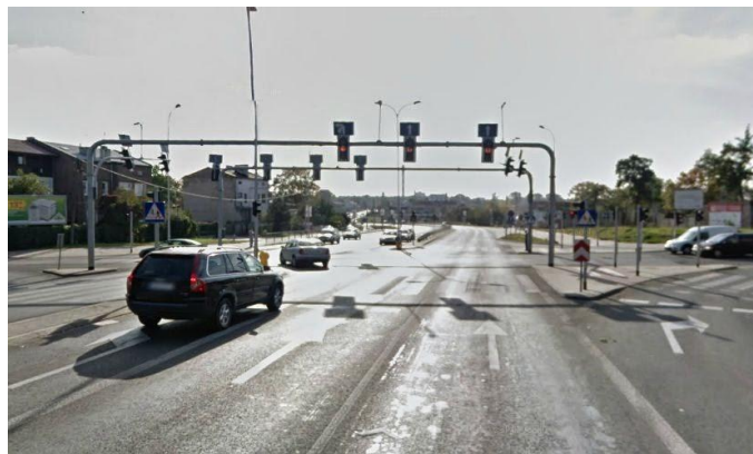
303 Squadron (Dywizjonu 303)- so nice to no longer to 42.195 km

In the mid-23 mile turn left and through the streets of the marginal and 303 Dywizjony across to Kunickiego. This is a very nice 1.5 km section of the route as a whole running down (seats up to 3% -4%).