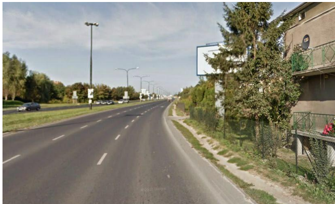
The first ascent on John Paul II (Jana Pawla II)

From this moment we run for about a mile down (1% -1.5%), reaching the street John Paul II.